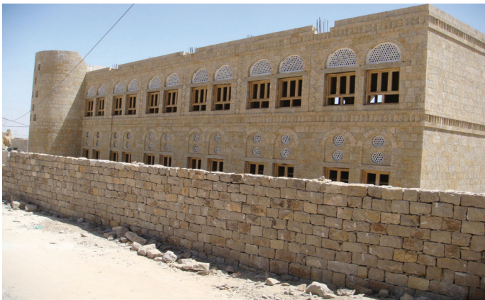
Qarin School - Eyal Hatem – Jabal Yazid – Amran

The quarter's projects were distributed over building, rehabilitating and equipping schools in various governorates, restoration of a number of schools affected by 2011 events and providing quality-program schools with furniture and educational equipment in four governorates. The projects comprise also building, furnishing and equipping a number of education offices, supporting education-excellence program activities and training Community Colleges' academic and administrative staff (in several governorates) in addition to other training courses and workshops.