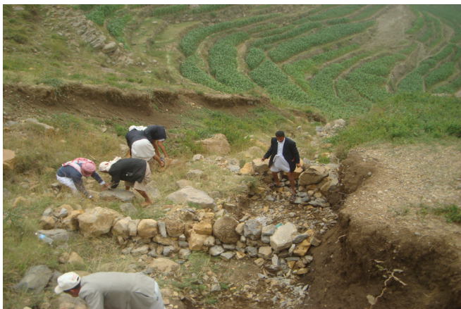
Repairing watershed of Wadi Majbar- Almahwit

The program targeted more than 145 villages (of the poorest areas) in 9 different sub-districts of various governorates. During the quarter, 25 projects (in different interventions, and based on the target areas' development plans) were approved, worth approximately $2.9 million. Thus, the total cumulative number of the IIP's projects - mounts to 262 projects at an estimated cost of $20.6 million, benefiting directly about 275 thousand people and generating nearly 552 thousand workdays.