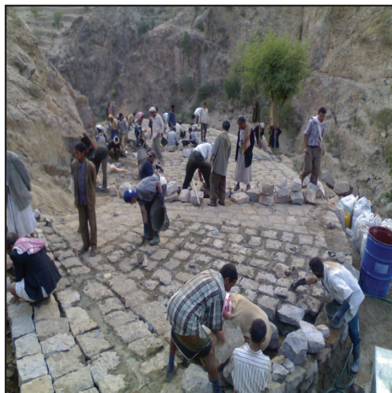
Paving Qaedat bani Masoud- Wisab Al-Aly

Thus, the cumulative number of the Road Sector’s projects reached 796 at an estimated cost exceeding $171 million. These projects benefit directly about 4.3 million people, and generate temporary employment reaching around 8.7 million workdays. These projects are distributed over rural roads (505 projects with a total length of 3,362 km), streets paving (234 projects, with a total area of more than 2.7 million m 2 ), training (54 projects) and bridges (3). During the quarter, 21 projects were visited – distributed over under-implementation projects (to assess the quality of works) and projects from 2012 Annual Work Plan (for assessing targeting quality and conformity to the established criteria). Thus, 246 projects were cumulatively visited.