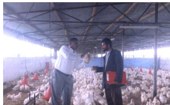
Training course in the field of Veterinary