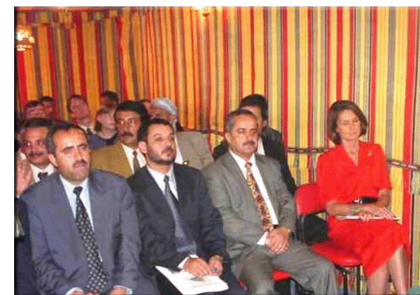
The American Ambassador, the Director of the Presidential Office, the Minister of Endowments and the Mayor of Sana'a' City during the inauguration ceremony