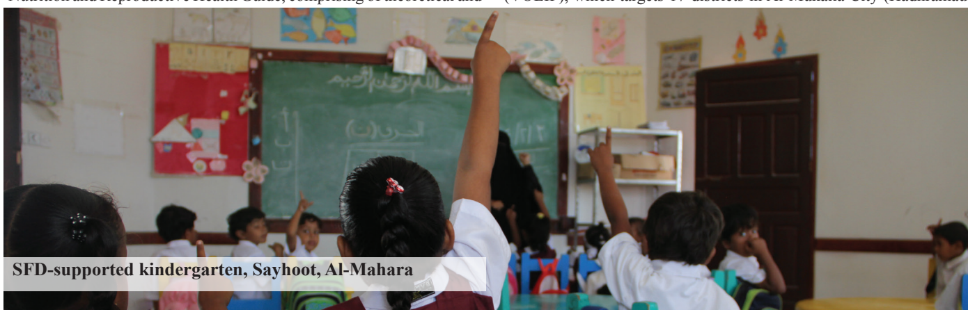
SFD-supported kindergarten, Sayhoot, Al-Mahara

SFD continued to implement the Vocational and literacy Program (VOLIP), which targets 17 districts in Al-Mukalla City (Hadhramaut)