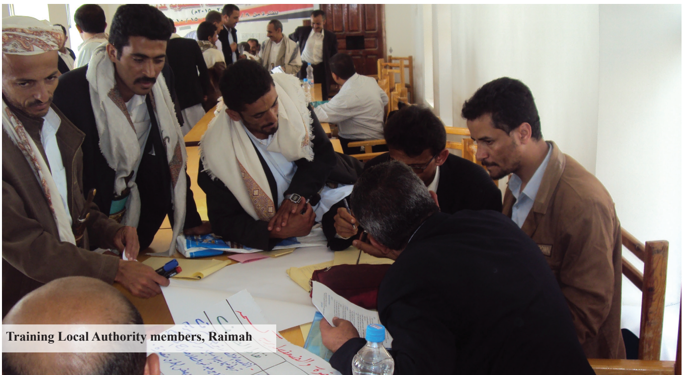
Training Local Authority members, Raimah