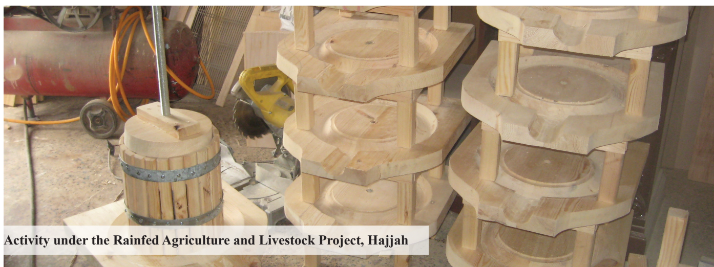
Activity under the Rainfed Agriculture and Livestock Project, Hajjah

During the quarter, 5 irrigation water barriers (distributed in Ibb, Sana'a, Al-Dhale' and Al-Baidha Govs), with the amount of irrigation-related stored water amounting to about 923 thousand cubic meters irrigating 108 hectares of agricultural area.