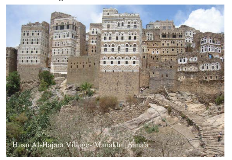
Third phase indicators - Cultural Heritage Sector*

In addition, the third phase of restoring the decorated ceilings was launched focusing on the central and western parts of the northern aisles and targeting an area of 343 m<sup>2</sup>. Ceilings to be treated within this phase have the worst conditions and are the most damaged and corroded.