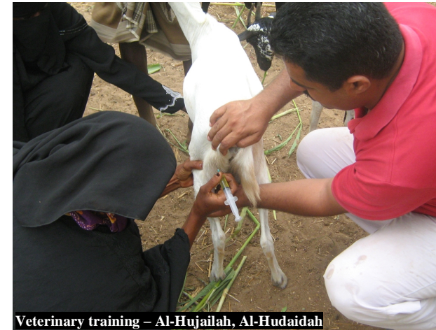
Veterinary training – Al-Hujailah, Al-Hudaidah

In technical coordination and joint action with the Second Component of the Rain-fed Agriculture Project (livestock development), The SFD financed the vaccination campaigns against ruminant plague. The campaign targeted 95,000 sheep, goats, cows and camels in 115 villages of Al-Hujailah, Gabal Ras and Al-Mansouriyah districts of Al-Hudaidah governorate.