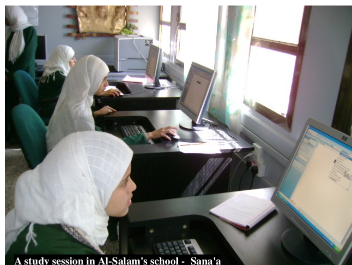
A study session in Al-Salam's school - Sana'a

* Includes only under-implementation and completed projects as of 31/12/2010