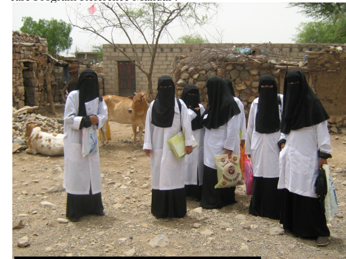
Community midwives trainers in several governorates

During the quarter, a training project was developed for community midwives' trainers in several governorates (Taiz, Hadramaut, Dhamar, Al-Baidha, Ibb) on the community care program and midwives trainers' curriculum (one-year system) was prepared as well as the practical skills manual was reviewed with the health institutes and the final revision of the SFD-developed Community-care Program Reference Manual.