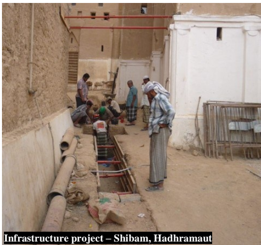
Infrastructure project – Shibam, Hadhramaut

As for the infrastructure project of the city of Shibam (Hadhramaut), the Unit Head paid a visit to the project in December 2010, whereby he met with Hadhramaut Deputy Governor. During the meeting, the two parties discussed and approved the 2011 Project Plan and agreed to visit the project every three months to assess the implementation progress.