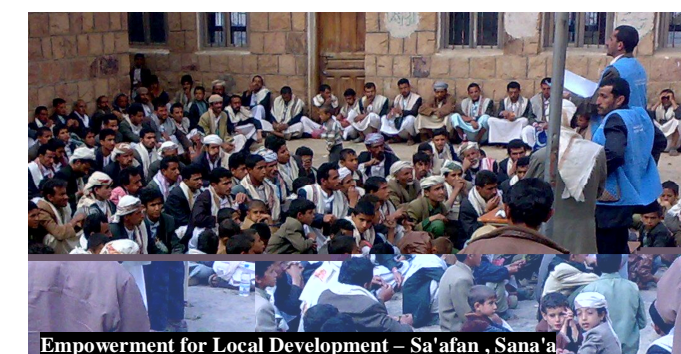
Empowerment for Local Development – Sa'afan, Sana'a

The third project provides support for the establishment of a public library in the town of Al-Baidha', to be managed by Al-Baidha' governorate Culture Office. Components of support included equipment, books and training for the library staff (2 persons) in indexing and documentation.