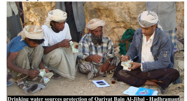
Drinking water sources protection of Qariyat Bain Al-Jibal - Hadhramaut

Under this phase, 40 EU- and UK-funded projects were approved worth nearly $5 million. These projects are distributed over six food-related sub-sectors of integrated intervention, roads, rainwater harvesting, terraces rehabilitation, agricultural land protection and reclamation and preliminary studies. About 44,000 people benefit directly from these projects, which will create more than 470 thousand working days. This brings the cumulative number of projects of phase II to 168 projects at a total estimated cost exceeding $20 million and the number of beneficiaries to about 280,000 people, with job opportunities of 2.1 million working days created, of which 17% for women.