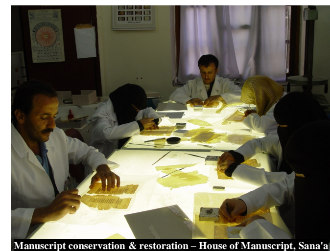
Manuscript conservation & restoration – House of Manuscript, Sana'a

Within the framework of continuous support of SFD for Dar Al-Makhtootaat (House of Manuscripts), electronic documentation and indexing of 1,152 manuscripts in Sana'a with photographs and descriptions of the content for each manuscript had been carried out by SFD. Materials for manuscripts conservation and restoration had been specially imported from Germany at a total cost of €64,000 for distribution to both the House and the Library of Manuscripts in Sana'a and Al-Ahqaf Library in Tarim (Hadhramaut).