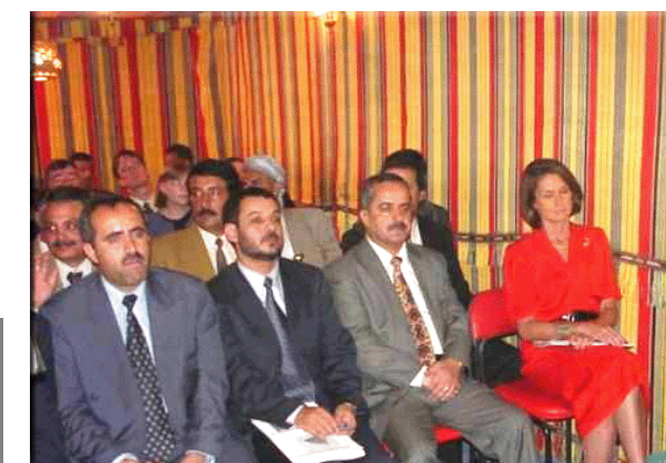
The American Ambassador, the Director of the Presidential Office, the Minister of Endowments and the Mayor of Sana'a City during the inauguration ceremony

The SFD Board of Directors held two meetings during the third quarter of this year. The first meeting was held on Monday July 9 th , 2001 and the second on