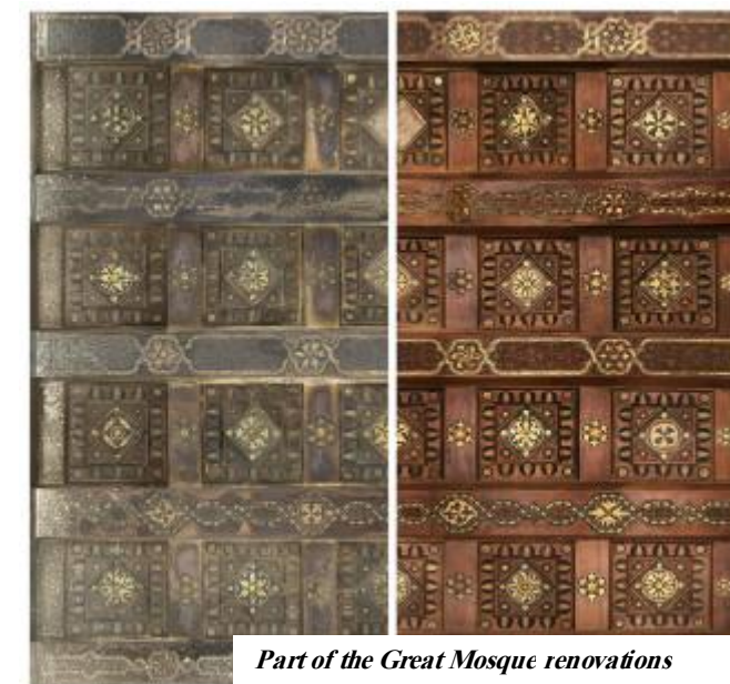
Part of the Great Mosque renovations

Two projects were approved in the quarter at an estimated cost of $1.3 million. Cumulatively, 154 projects have been developed worth an investment of $23.2 million.