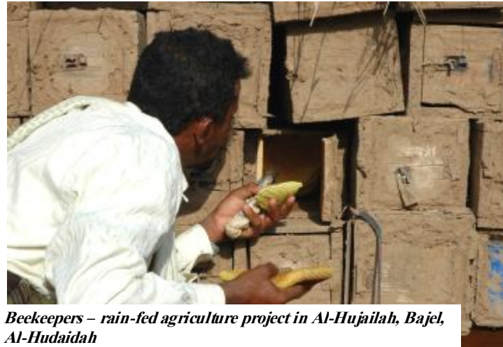
Beekeepers – rain-fed agriculture project in Al-Hujailah, Bajel, Al-Hudaidah