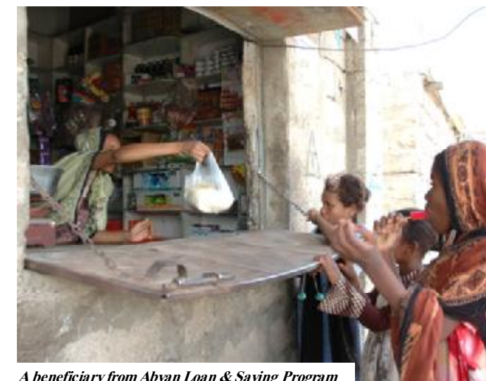
A beneficiary from Abyan Loan & Saving Program

An operation-risk management course was held on March 18–22, 2007 for microfinance institutions and programs. The course, attended by 22 male and female trainees from these institutions and programs, aimed to let participants know about the means and tools of control and monitoring during operations in order to reduce the operational risks posed to workers while on duties.