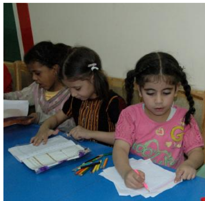
Al-Rahmah Orphans Home, Sana'a

In addition, the SFD continued its support for the Ministry of Social Affairs and Labor in preparing a national strategy for the disabled. In this regard, the SFD—in association with the World Bank—organized the first preparatory workshop for designing the strategy, which concentrated on specifying work frame and the strategy outlines. At the workshop, representatives of ministries, NGOs working with the handicapped discussed the recommendations and the outlines concluded in the report prepared by the World Bank expert.