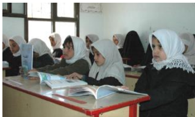
Girls-only classroom, Al-Masabeeh School, Sahara, Sa'adah

In community structures, six workshops were held for female and male students, school administration and supervisors of activities in the districts of Al-Sukhnah (Al-Hudaidah) and Maqbanah (Taiz). Attended by 231 students, 22 school headmasters and activity supervisors, the workshops aimed to complete the capacity building of school administrations and students structures as well as to come up with a vision on students' structures and their participation in designing school activities plan. They also aimed to let participants know about the democratic exercises within the structures. Additionally, efforts were exerted to build the capacities of rural-girl skill-development centers by staging courses on leadership, organization and preparing the plans. The courses targeted eight female facilitators from these centers in the two mentioned districts. Furthermore, capacity-building activities focused on women structures and mothers' councils in 15 villages in the Al-Dhale', Al-Hudaidah and Amran governorates through conducting 10 training courses (six days each)—with emphasis given to practical aspects. The courses, attended by 194 participants aimed to help participants acquire new skills and knowledge in organization, communication and food and domestic production, pursuant to the simple means available in the