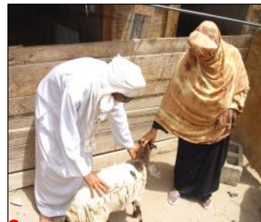
§ A female beneficiary from microfinance programs in Aden

In continuation with its efforts to support the microfinance programs in Aden, the SFD has allocated a new fund of US $500,000 to be used for on-lending purposes in the programs, in addition to supporting the institutional capacity of the programs, the development of their systems, and staff training.