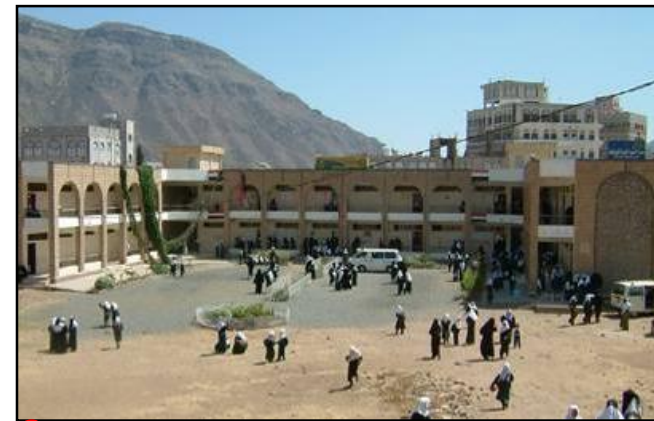
§ SFD-supported school with facilities for integrating the disabled in the mainstream society (26 th September School in Ibb)