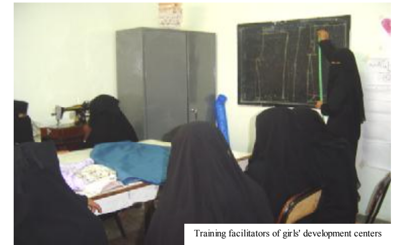
Training facilitators of girls' development centers

Several training courses were conducted, including one (held on 14–20 September 2007) focusing on simple accounting for non-profit associations. The course was attended by eight administrative-body members of the Al-Sukhnah (Al-Hudaidah) atelier. Additionally, two courses focusing on first aid, reproduction health and family planning were carried out for mothers' councils and literacy students in the Al-Muga'eshah sub-district (Maqbanah district /Taiz) with 47 women participating.