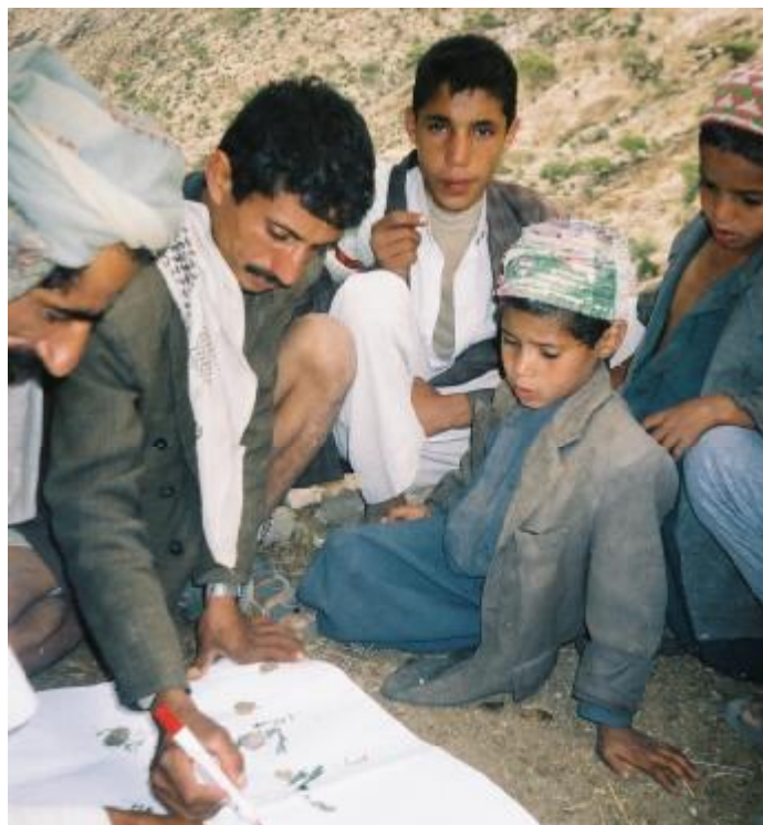
Setting CBOs for Al-Suds & Bani Bugair sub-districts at Al-Haimah Al-Kharejyyah in Sana'a governorate

The steering committees of six associations (three in Dhamar and Al-Baidha', each) collectively benefited from two training courses in handicrafts (transformation of household trash to handicraft products)—supervised by the SFD's Dhamar branch office.