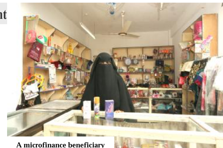
A microfinance beneficiary