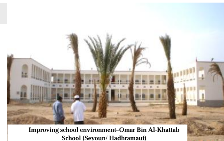
Improving school environment–Omar Bin Al-Khattab School (Seyoun/ Hadhramaut)

* includes only under implantation and completed projects as of 31/3/2006