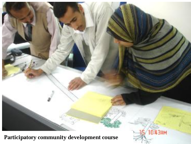
Participatory community development course