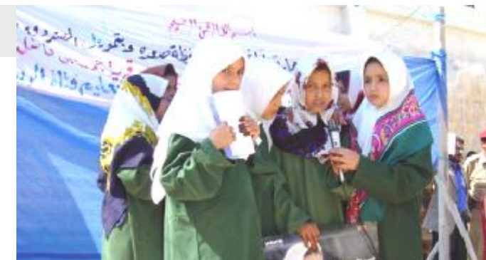
Awareness on girls' education (Sa'adah)

to education). In addition, the period 21–26 February 2006 witnessed the training of 24 consultants (11 male and 13 female) on Participatory Learning and Action (PLA).