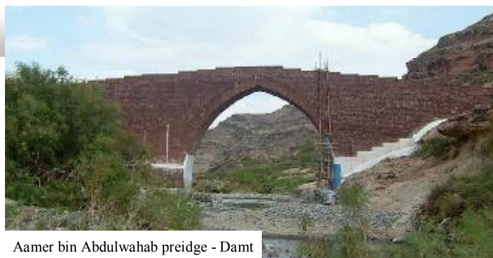
Aamer bin Abdulwahab preidge - Damt

the building, Qadhadh works and the wooden painted ceilings, which had suffered from humidity and rodents, shall be restored or repaired. During the process, three persons shall be trained on the basic rules of disassembling and restoring historic wooden decorations.