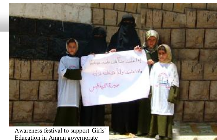
Awareness festival to support Girls' Education in Amran governorate

Training course in school activities was held on 25 June–01 July 2005, with the participation of 22 male and 5 female trainees (supervisors of school activities) in the program's intervention schools in Sa'adah, Amran, Al-Hudaidah, Taiz, Al-Dhale' governorates. The course comprised three main stages. The first was an initial phase, and focused on childhood issues (needs of childhood, growth of basic-education children and the required educational role...) as well as child games (importance of playing in child growth, learning through playing, playing inside and outside the school and popular games...). The second stage presented school activities, and pinpointed the practical aspects of the summer club activities. It included the essence of school activity, development of "school activity" concept, its objectives and types, participation of children in school activities, and school activity planning. In the third stage, a proposition was discussed with regard to the establishment of a club for each school.