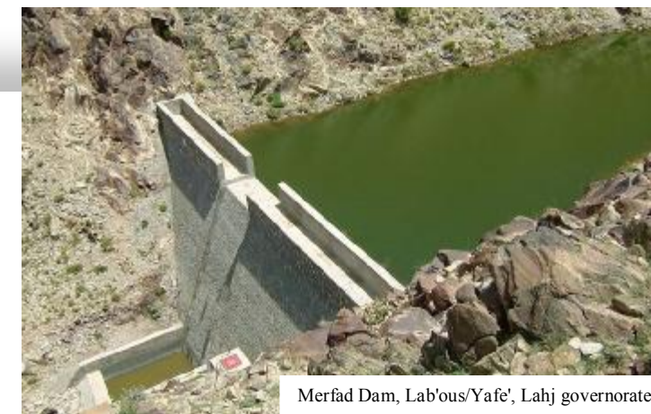
Merfad Dam, Lab'ous/Yafe', Lahj governorate

As part of the promotional event of the "Small and Micro Enterprises Days", twenty-two participants representing all the small and micro enterprises programs and foundations joined the second workshop of SFD partners. During the workshop, progress and performance of the programs and foundations were presented, and their achievements were compared to the indicators planned for the second quarter of 2005. Also, the issue of establishing a microfinance network in Yemen was discussed.