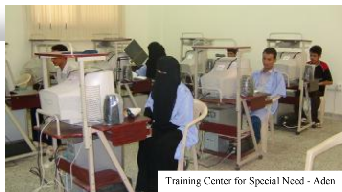
Training Center for Special Need - Aden