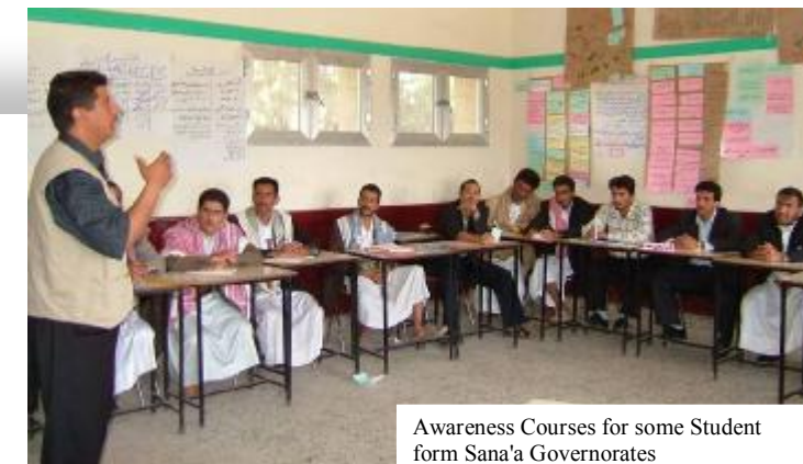
Awareness Courses for some Student form Sana'a Governorates

The women branch of the Social Care and Solidarity Society in Taiz benefits from this project. Through this intervention the leadership of women branch is being trained, equipped and provided with the relevant requirements in correspondence with the activities of the Society, which raises the level of performance and rendered services.