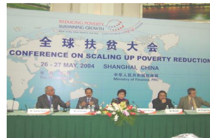
Part of the participating delegations' Heads during one of the conference sessions