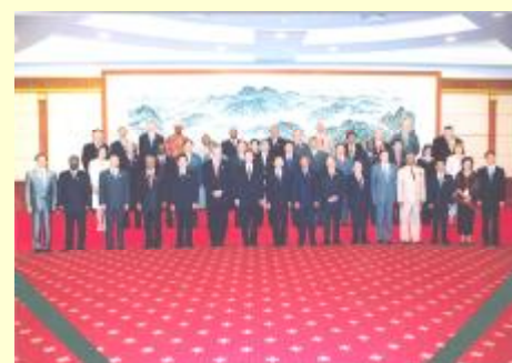
A memorable picture showing the Chinese Prime Minister with the guests participating in the Int'l Poverty-Reduction Scaling-up Conference held in Shanghai (China)

The SFD is particularly thankful to the "Al-Thawra" daily newspaper, Yemen Space Channel, Yemen News Agency "SABA" and the "26 September" weekly newspaper... for the continuous and strenuous efforts they have exerted in contributing to reflect the SFD's increasingly progressing profile and covering the event-related activities, during both the preparation and participation stages. We appreciate also the coverage of the two national radio stations: the First (Sana'a) and the Second (Aden) Programs as well as the English-published bi-weekly "Yemen Times".